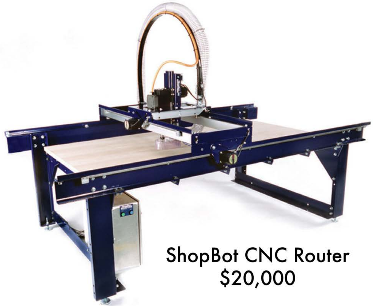
ShopBot CNC Router $20,000