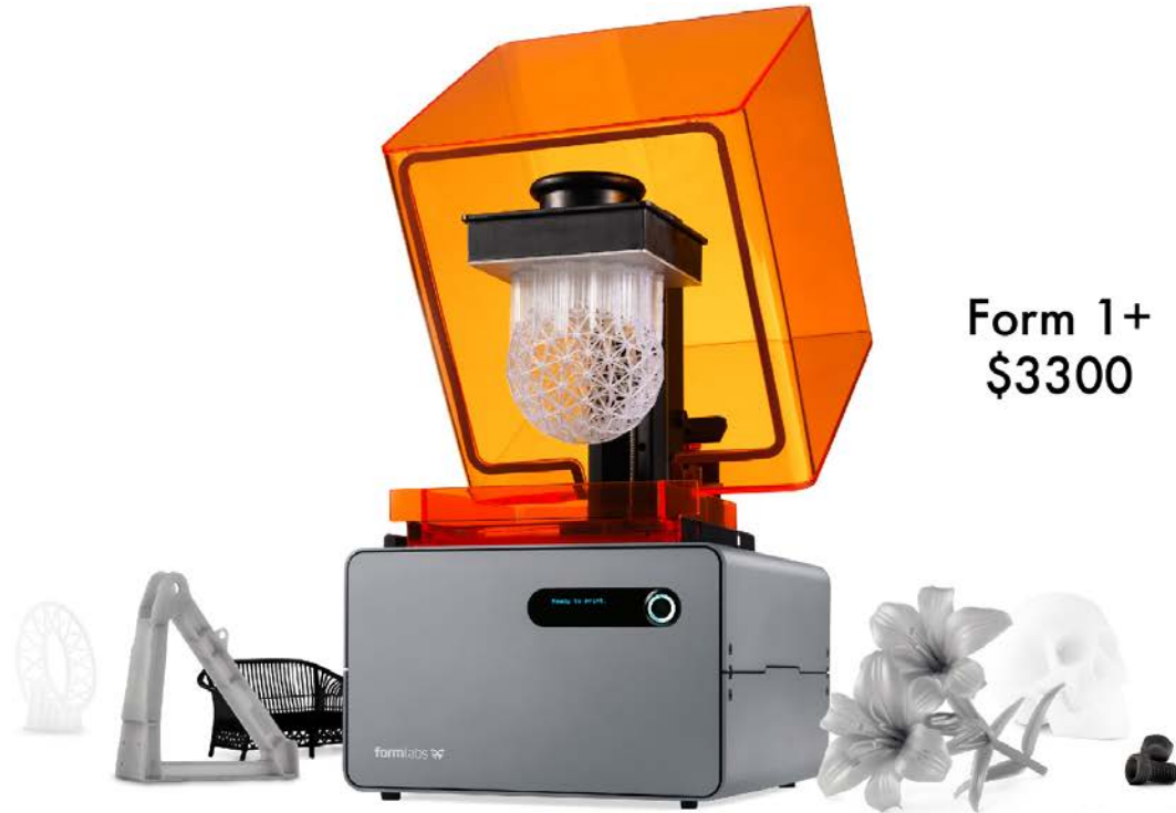
Form 1+ $3300