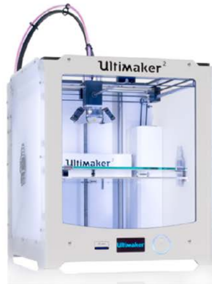
Ultimaker 2 $2700