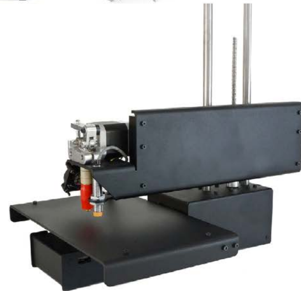
Printrbot Simple $600