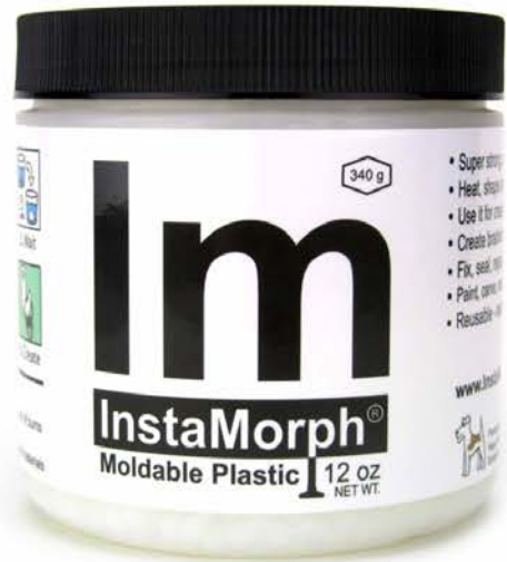
Moldable Plastic $20